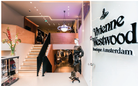
VIVIENNE WESTWOOD PIETER CORNELISZ HOOFDSTRAAT 116, 1071CD

Welcome to W Amsterdam. Get ready to uncover what's new & next in this amazing city. Whether you're visiting for work or pleasure, we've got you covered with the coolest locals-only tips to maximize your stay.