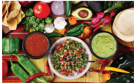
ARRIBA ARRIBA ROZENGRACHT 114, 1016NH

INSIDER TIP: Reach out to your W Insider when you're planning to visit the store for a special discount.