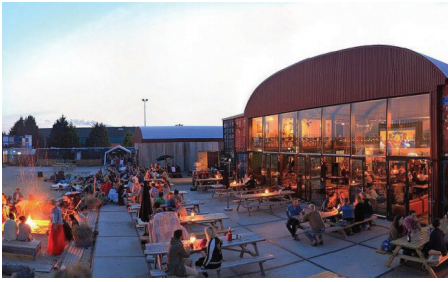
PLLEK TT NEVERITAWEG 59, 1033 WB

Only 15 minutes with the ferry from the Central Station there is a place where beach and city life has been seamlessly combined. Enjoy a beer at the campfire on the beach and lay back listening to some music. They even organize yoga classes, massages and film nights on the beach. Must we say more?